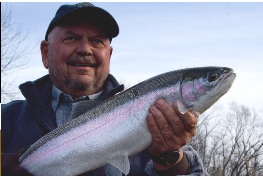
A perfect PM River steelhead caught and released yesterday!